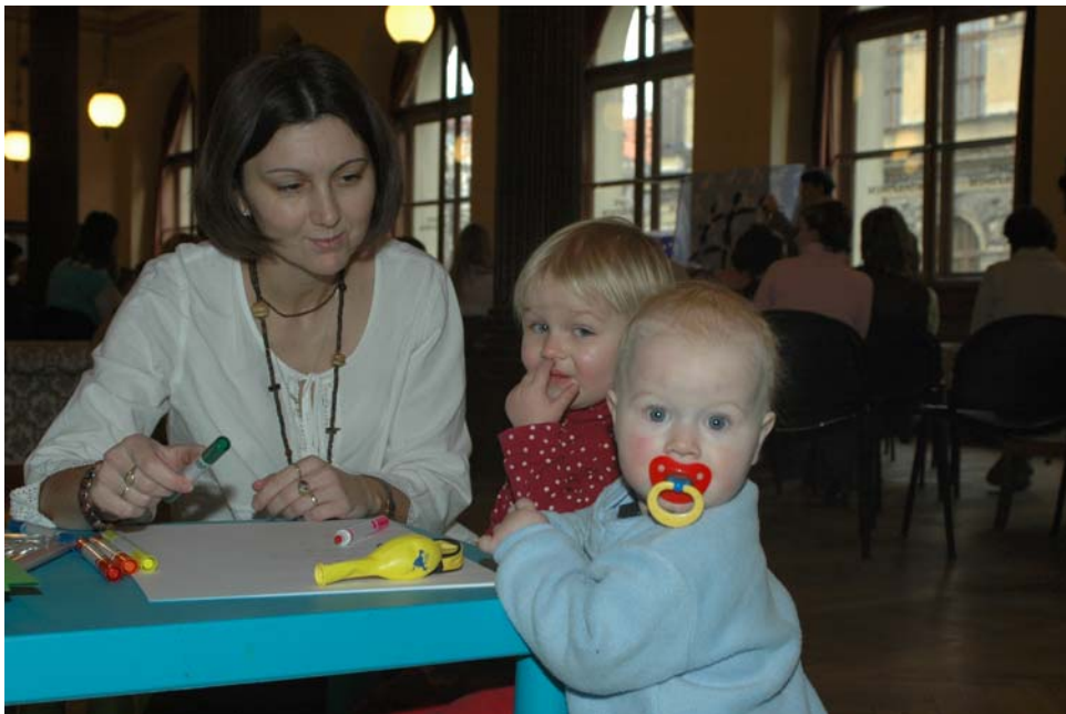
Babysitting at every occasion